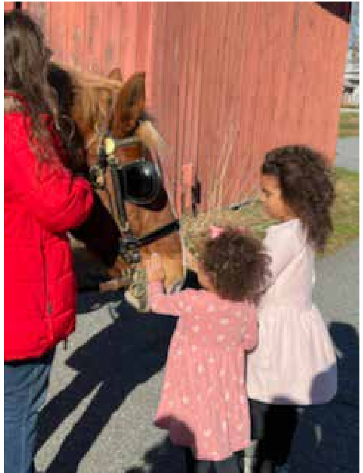
Ritz gets some loving from admirers while waiting to deliver Santa to Madison's festivities!