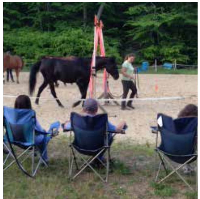
Agility Demonstration.