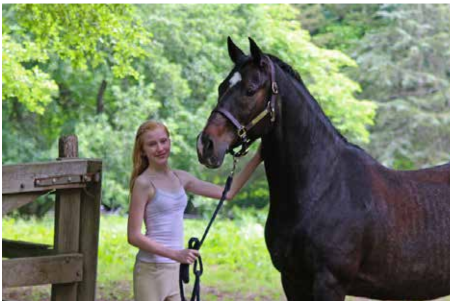
A couple of Beverly Torell's photos from the Judy Bosco Photographing Horses Clinic.