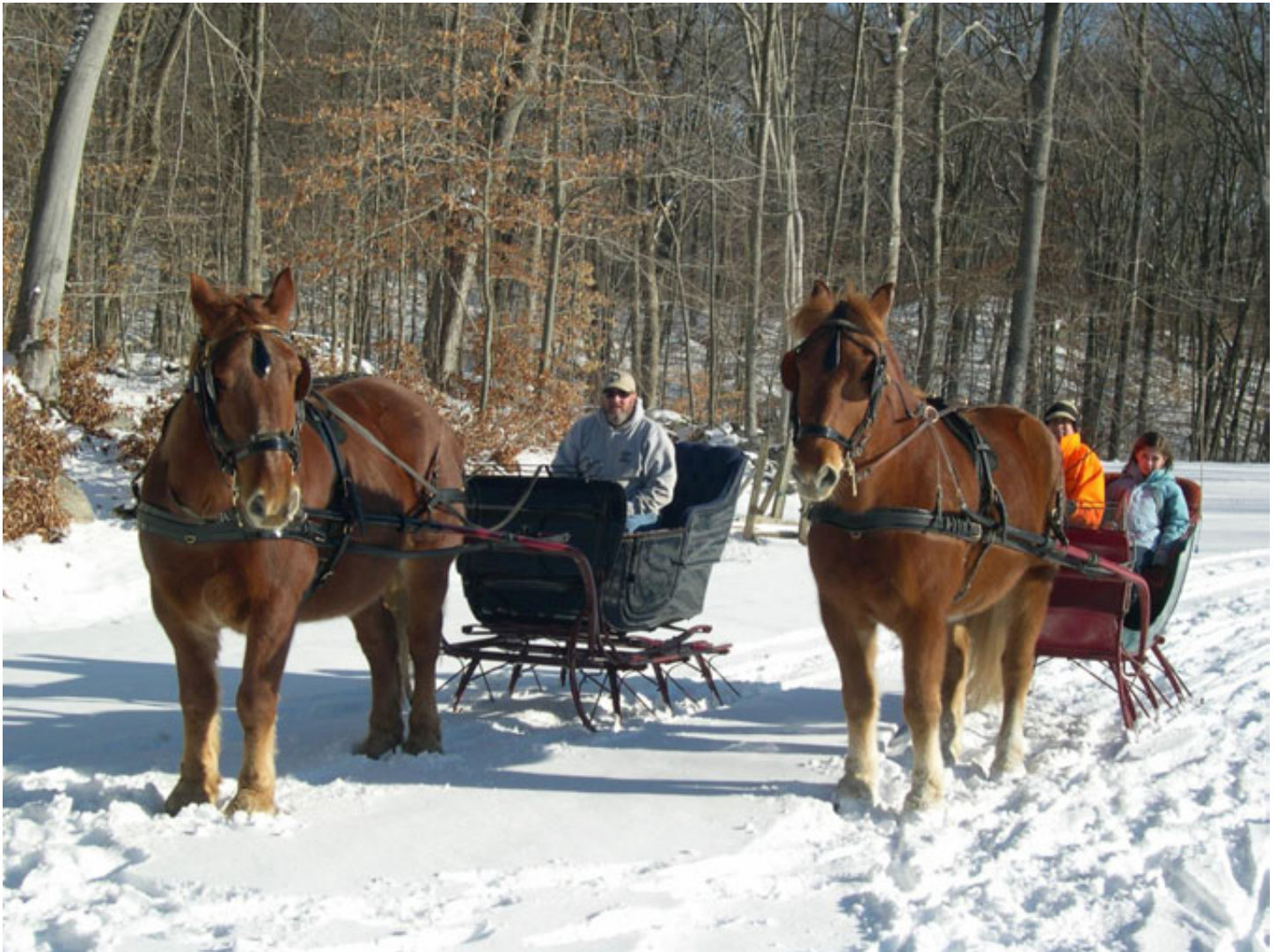
~ Wedge and Max ~

I apologize for the lack of my usual enthusiasm, but it's been a hard couple of months. As many of you know we lost the sweet, red Suffolk Max to colic on April 7—he was only ten years old—and now the older draft, Wedge, has also come to the end of his days. His hip had gotten so bad he can no longer support weight on his back end. I know it is part of having animals but it just doesn't get any easier with repetition. They rip your heart out every time. The barn will be really quiet with just Homes and Doolin. Thank you for all your cards and notes—we really appreciate the concern.