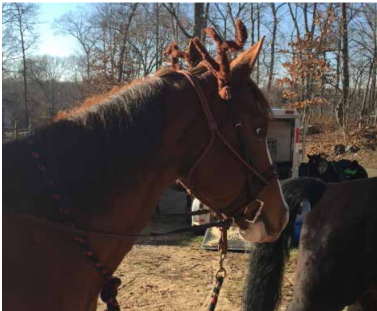
Photo from last year's Progressive ride

We are looking for hosts and locations for our Christmas Progressive Ride and the Holiday Party. If you and a friend ride out to meet each other and trail ride and either of you have room to park some trailers, please consider hosting this ride. If your house has space for a party and some parking and you like low-key, potluck entertaining we would be so grateful. If you have another idea for either event we would be happy to hear it. Please get involved.