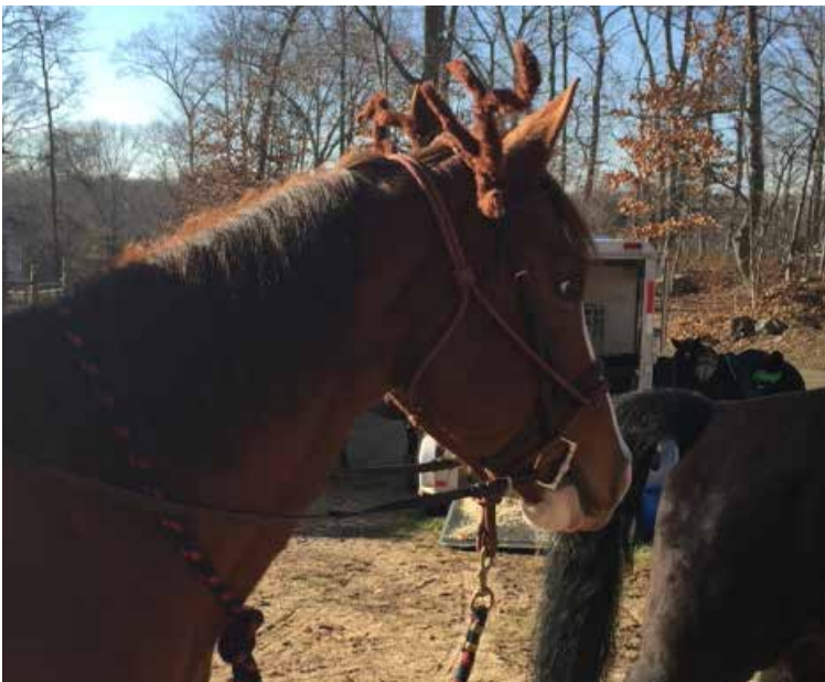
Photo from last year's Progressive ride

We are looking for hosts and locations for our Christmas Progressive Ride and the Holiday Party. If you and a friend ride out to meet each other and trail ride and either of you have room to park some trailers, please consider hosting this ride. If your house has space for a party and some parking and you like low-key, potluck entertaining we would be so grateful. If you have another idea for either event we would be happy to hear it. Please get involved.